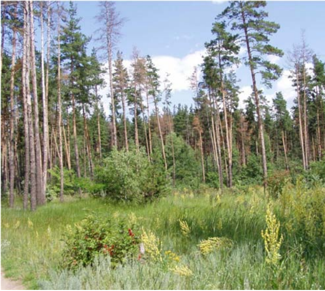
Figure 6. Dying off of the Pine Trees Caused of H. Annosum .