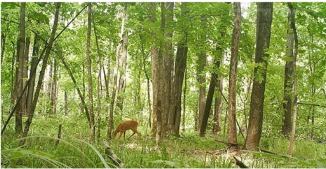
Figure 4. The Sites of Natural Wood.