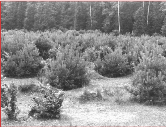
Figure 10. Group Planting of a Pine.