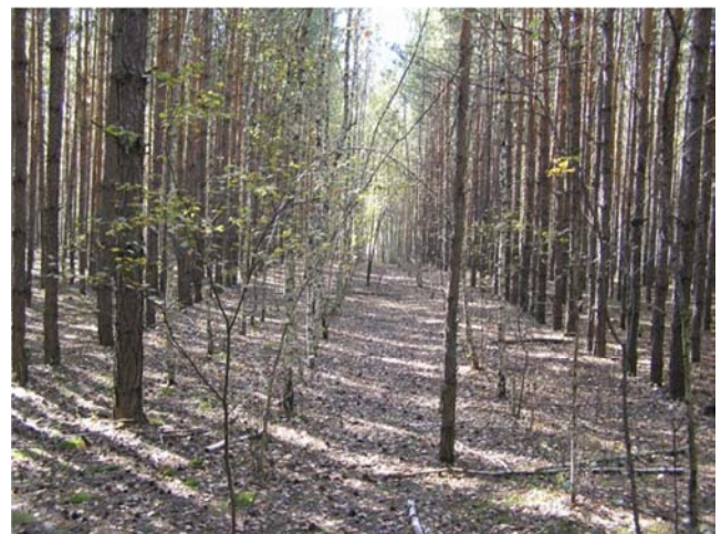
Figure 5. Pine Monocultures.

The tree species in Voronezh Nature Reserve are a combination of pine (32.3%, oak (29.3%), aspen (19.3%), birch (5.7%), black alder (5.2%).