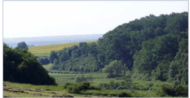
Figure 1. Typical Landscape of the Central Russian Forest-Steppe.

example, noticeable warming and moistening of weather conditions caused a mass invasion of an Ash borer ( Agrilus planipennis ) who promoted mass dying off a European ash ( Fraxinus excelsior ). The climate here becomes specific: the typically Russian continental winter with thorny frosts and large mountains of snow and dry hot summer winds they were replaced by long thaw, fogs, and small-drop rains. In general, present weather reminds sometimes the subtropical climate. Precipitation varies from 700 millimeters in the northwest to 650 millimeters in the southeast. But they are very uneven and irregular.