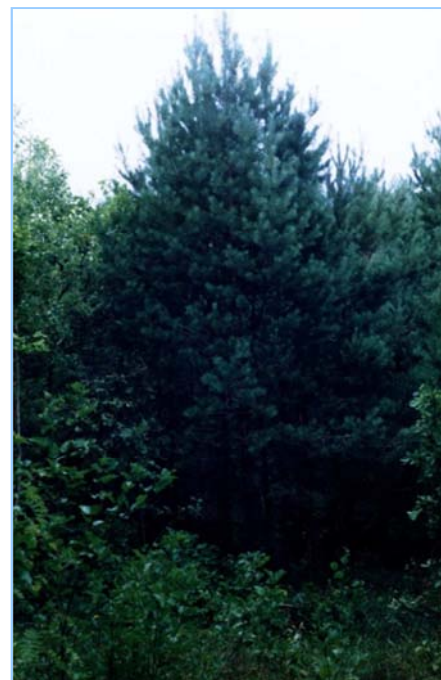
Figure 9. Middle-Aged Group of a Pine.