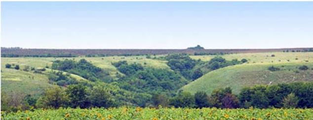
Figure 2. Ravines in the Central Russian Forest-Steppe.

Erosive processes in the territory of the Central Russian forest-steppe are very active (Figure 2).