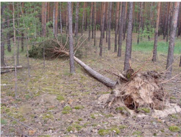
Figure 7. Dead Pine Tree (25-year-old) Infected by H. Annosum .

The pine monocultures (Figure 5) dominate. They are intensively damaged by pathogenic organisms (Figures 6, 7). Among pathogenic fungi in oak plantings the most mass is the Erysiphe alphitoides , causing oak powdery mildew, is a major foliar pathogen of Quercus robur . Young plants of a bass aged till 3 years die off. In mature trees the disease is generally less damaging, it can contribute to tree decline and reduce decorative effect of plantings. In pine planting fungus H. annosum . Annosum root rot is considered to be the most economically important forest pathogen in the Usmansky forest.