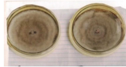
Figure 4. Plate of the fungi isolated from diseased coconut seed.