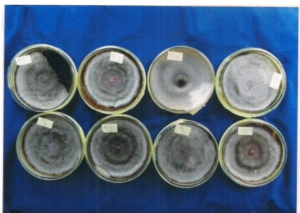
Figure 3. The root extract inhibition of the growth of Ceratocysis paradoxa .